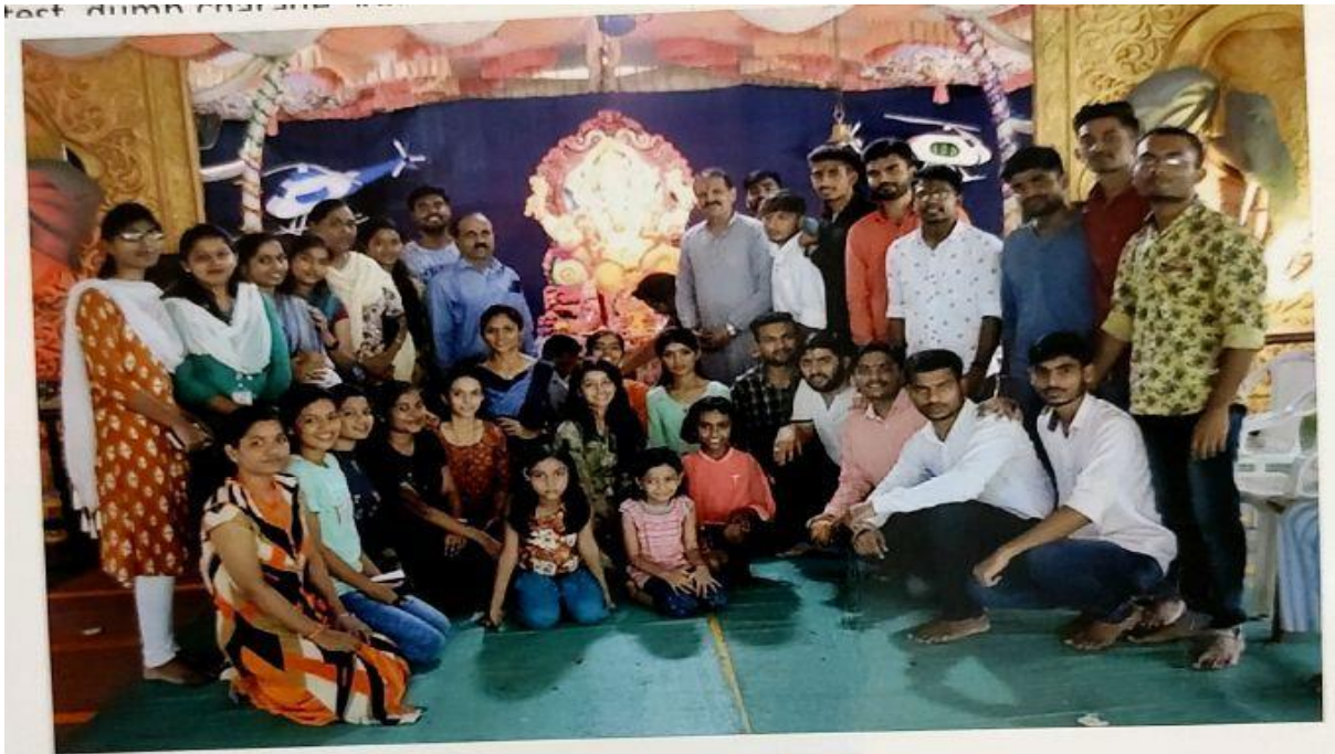
Ganesh Utsav 2019